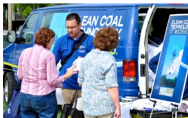
Clean coal technology fair in US

As an example of upgrading, he mentions using waste heat for the fluidised-bed drying of lignite before combustion. RWE installed a prototype of this concept at its Niederaussem facility. It improves efficiency by as much as four to five percentage points, and can safely dry up to 80 tonnes